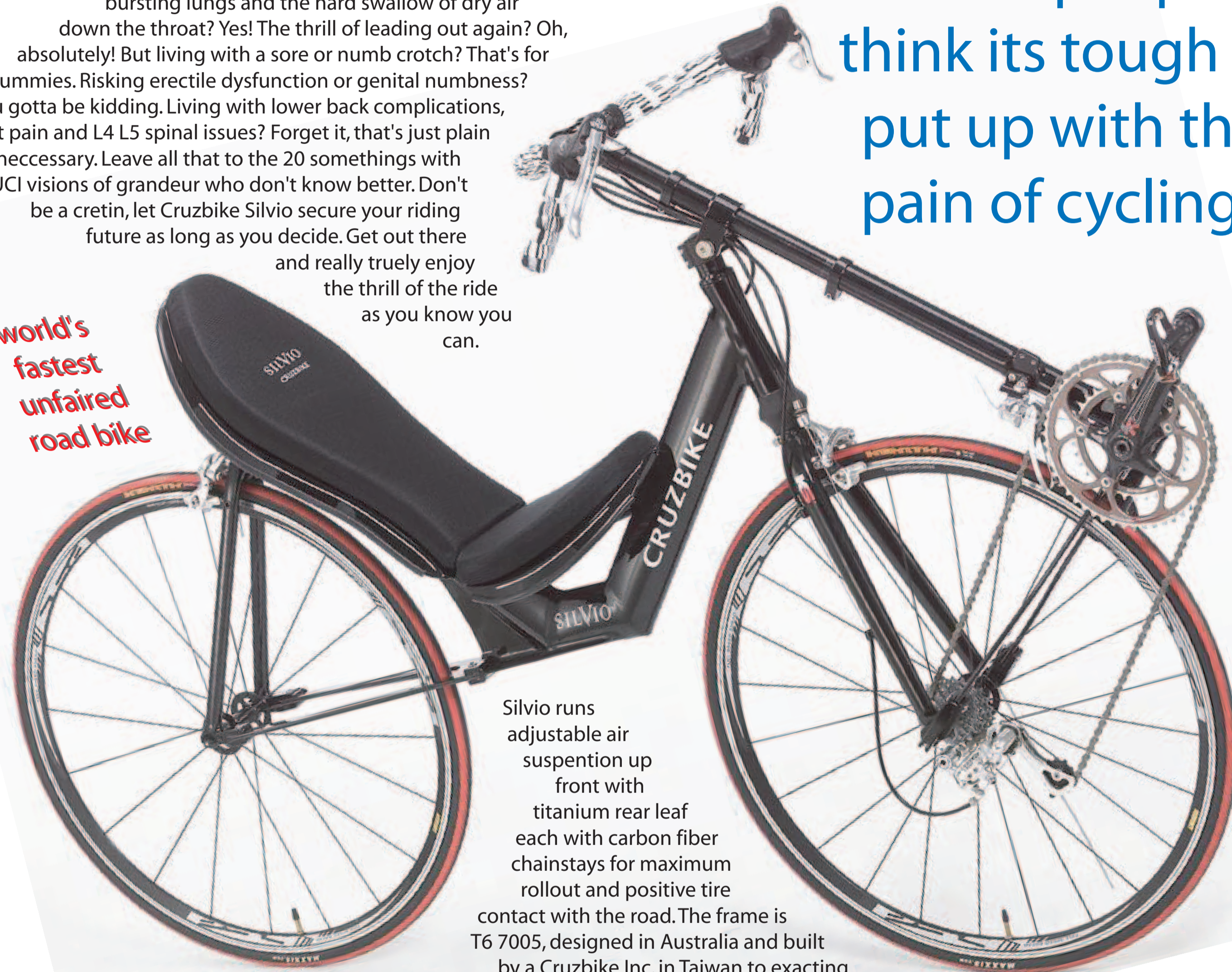
Silvio runs adjustable air suspension up front with titanium rear leaf each with carbon fiber chainstays for maximum rollout and positive tire contact with the road. The frame is T6 7005, designed in Australia and built by a Cruzbike Inc. in Taiwan to exacting specifications.

1. ERGONOMICS Recognise the road biker's physical fitness and muscle development from regular and intense road training.